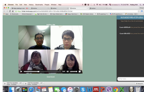
Figure 4 The recording link where user can re-watch and download the recording video

We conducted a preliminary experiment in a group of four subjects including a Mexican student and a Vietnamese student who both speak English as a second language and two Japanese students. All subjects are familiar with some popular video chat applications like Skype or Facetime, however, the recording function with strict turn-taking approach is totally new to them. The experiment is carried out by two stages: Stage 1 using BiTak without turning on Recording function which also means strict turn-taking is not employed either and Stage 2 using BiTak with employing Recording function and strict turn-taking approach. In each stage, the two Japanese used English while the foreigners practiced Japanese concurrently.