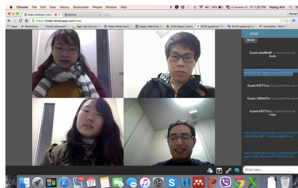
Figure 3 Group chat interface

The next person will take turn to talk by repeatedly clicking the Recording Button. Therefore, the communication style with using BiTak is in a half-duplex manner similar to that of a transceiver. The users can download all the recording videos for further reference.