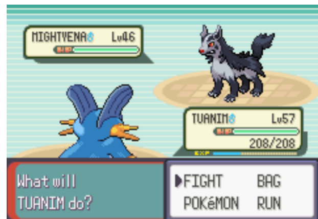
Fig. 1: A screenshot of Pokemon Emerald

So, we focus on Pokemon battle which is the core part of of