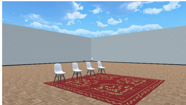
Figure 1: Image of VR room in cluster.

In traditional SGE conducted in a physical space, arranging for a larger room is essential, but making environmental adjustments can be challenging. In the metaverse, however, it was straightforward to create a comfortable room tailored to the participants’ needs. The VR room utilized in this study is depicted in Figure 1.