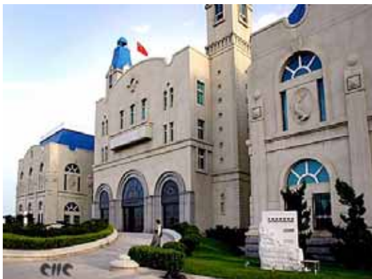
Fig 4. Dalian Nature Museum

In Dalian not only the industry, but also the progress of science and technology is undergoing. There are over 15 Universities and Colleges, and many research institutions. The museums of Nature, of History and of Conchology are well known all over the country.