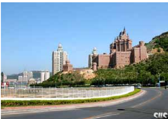
Fig 5. Dalian Conch Museum

Initiated by the municipal government of Dalian, a plan to build a virtual knowledge city on the metropolitan area network is undertaking.