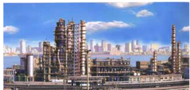
Fig 2. Dalian Petro-refinery

Dalian is a coastal city in the northeast part of China. It is founded in the year 1899. The city's human society can be traced as far back as 17000 years. Dalian became a coastal open city in 1984 under the ratification of the central government. It has attracted a large number of hi-tech professionals and is a choice place for high-tech industries. There are many high-tech enterprises including the knowledge-intensive companies.