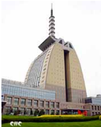
Fig 3. Dalian TV-Center

In Dalian not only the industry, but also the progress of science and technology is undergoing. There are over 15 Universities and Colleges, and many research institutions. The museums of Nature, of History and of Conchology are well known all over the country.