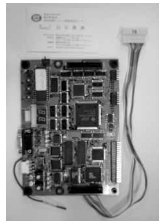
Fig.3. DSP board