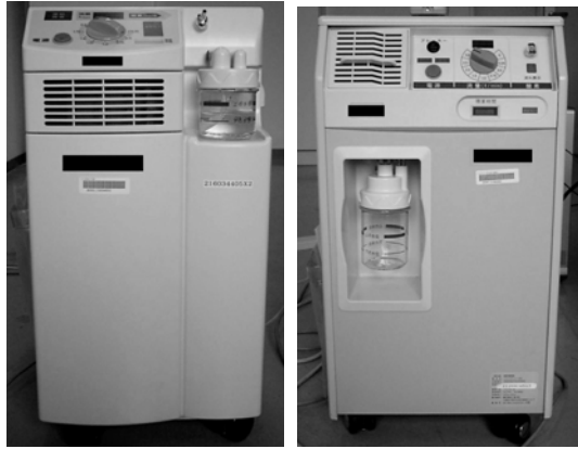
a) type A b) type B Fig.2. Oxygen concentrator

In the evaluation procedure, the influence of the starting points for recognition accuracy was considered. We determine the starting point by observation in advance, and then we evaluate using the starting point that is shifted in small steps. The result of this experiment reveals that if the misalignment of the starting points is less than 0.1sec, the system can recognize the alarm sound correctly. A band pass filter is applied to counteract the noises: The simulation shows it can resolve the noises effectively.