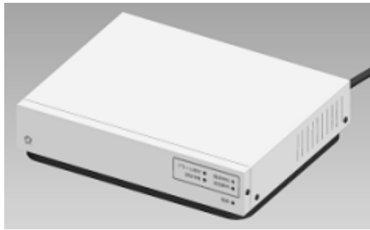
Fig.4. Additional Unit

In Table 4, “Depend on target” means that these parameters have given a definition in specification information [7]. And we can handle these parameters for feature extraction according to the different demand.