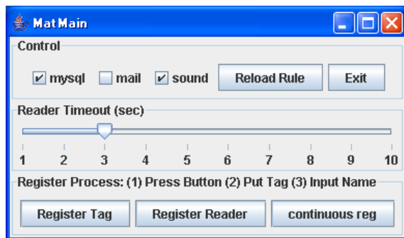
Figure 3. Event Logging Application

We developed a simple event-logging application that monitors the detection events of the RFID tags (see Figure 3). When an RFID tag is detected by an RFID reader, a data pair (tag ID, reader ID) is generated and is registered as an “enter” event. When the tag leaves the field, the event “exit” is registered. To prevent irrelevant detections or missing events, the user can set “timeout” by the slider. By pressing the “register tag” button, the user can label the tag. The application also has functions to log the data in MySQL, email when the detected pattern matches preloaded rules, and notify the caregivers by alarm. The system will be provided with a rule editor that enables the caregivers to modify the conditions and trigger events easily.