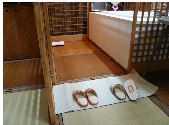
Figure 2. Slippers patched with passive RFID tag sheet