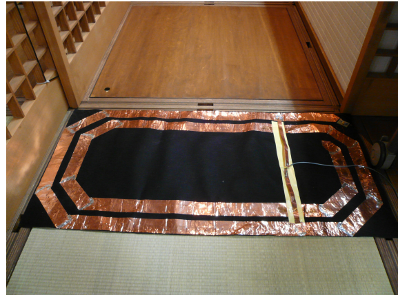
Figure 1. Our RFID antenna sheet

shoes while walking around the rooms. They seldom lose their slippers since these are personal belongings, and they are careful about not losing their slippers. The passive RFID tag sheets attached below the slippers can be identified by the RFID antenna sheet and reader. Since the passive RFID tag sheet does not require additional treatments such as charging batteries, it is suitable for conventional group homes.