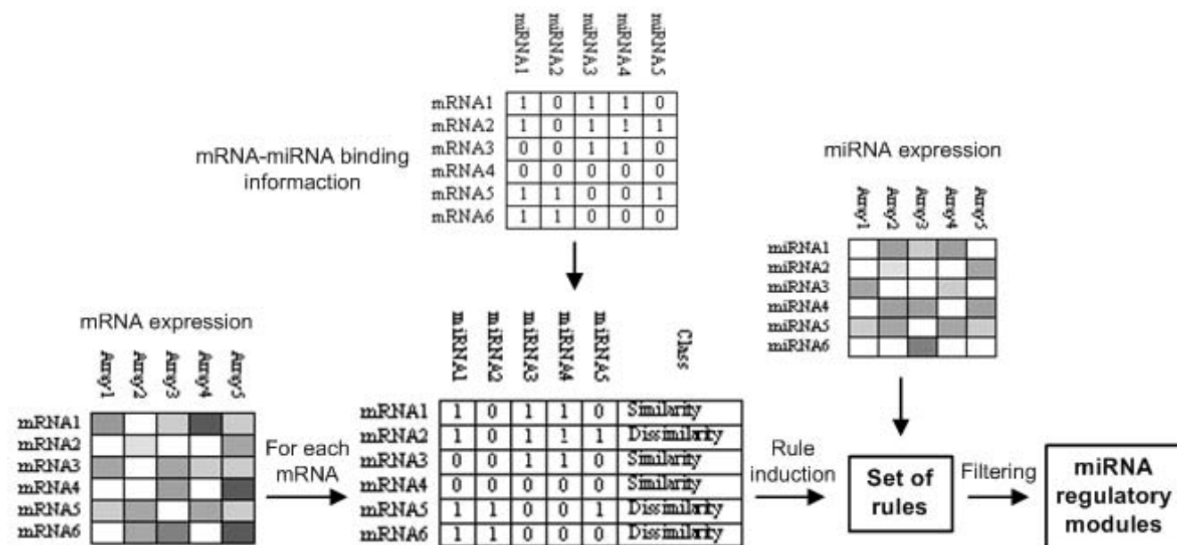
Figure 2 Schematic description of our method for finding MRMs. An overview of our rule-based method for finding miRNA regulatory rules from multiple information sources, including miRNA expression profiles, mRNA expression profiles, and miRNA-target binding information.

where x_i and y_i are the i th sample values of genes x and y , respectively; \bar{x} and \bar{y} are mean values obtained from m samples of genes x and y , respectively. The PCC of a pair of genes commonly returns a real value in [-1, +1] . PCC(x, y) > 0 represents that x and y are positively correlated with the degree of correlation. On the other hand, PCC(x, y) < 0 represents that x and y are negatively correlated with a value |PCC(x, y)| . A positive value of the PCC indicates that two genes are co-expressed and a negative value of the PCC indicates that opposite expression pattern exists between them. We can see that with this measure, genes with low- and high-expression values may be placed in the